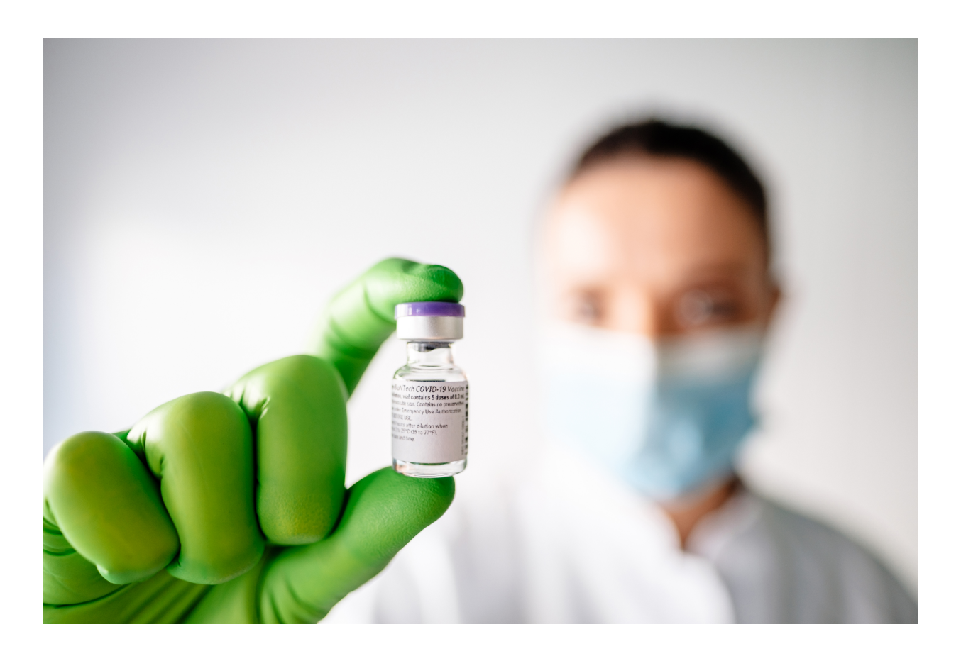
BioNTech SE Quarterly Report of BioNTech SE for the Three And Nine Months Ended September 30, 2022